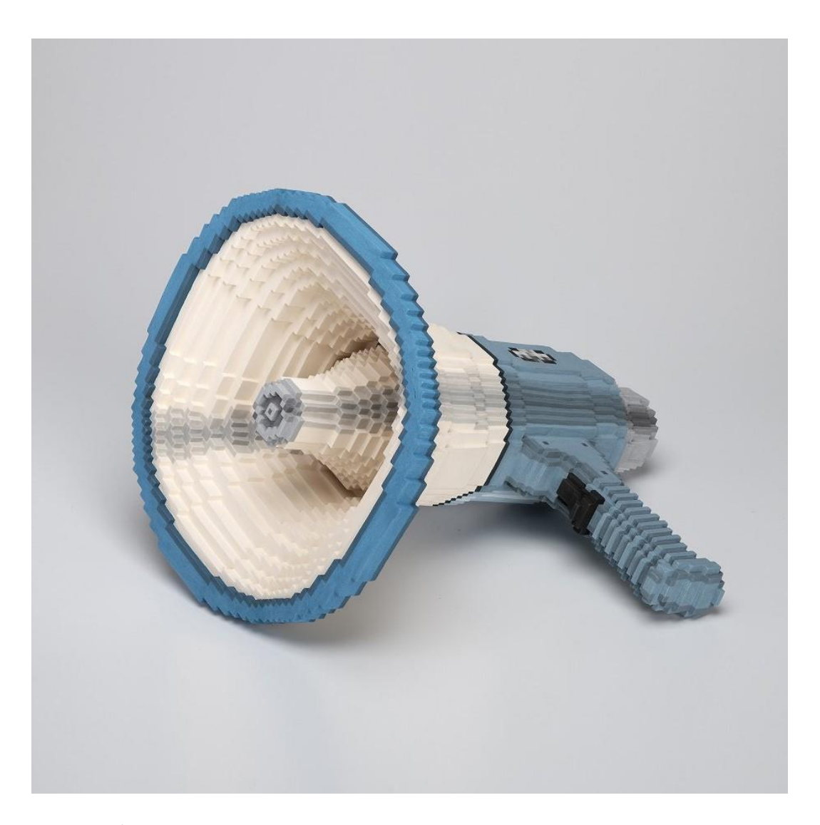
3. Low pixel CG – Speaker 2019 ceramic w40.5 h30.0 cm