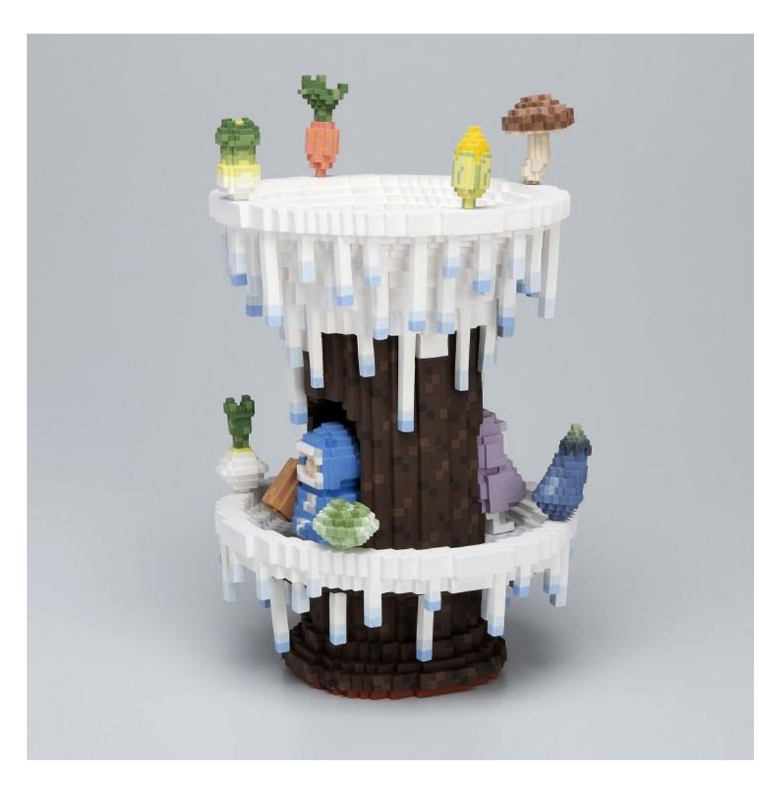
2. Low pixel CG -Homage to the original porcelain vase in the form of two polar bears inside an ice cave by Miyagawa Kōzan I 2019 ceramic w21.0 h34.0 cm