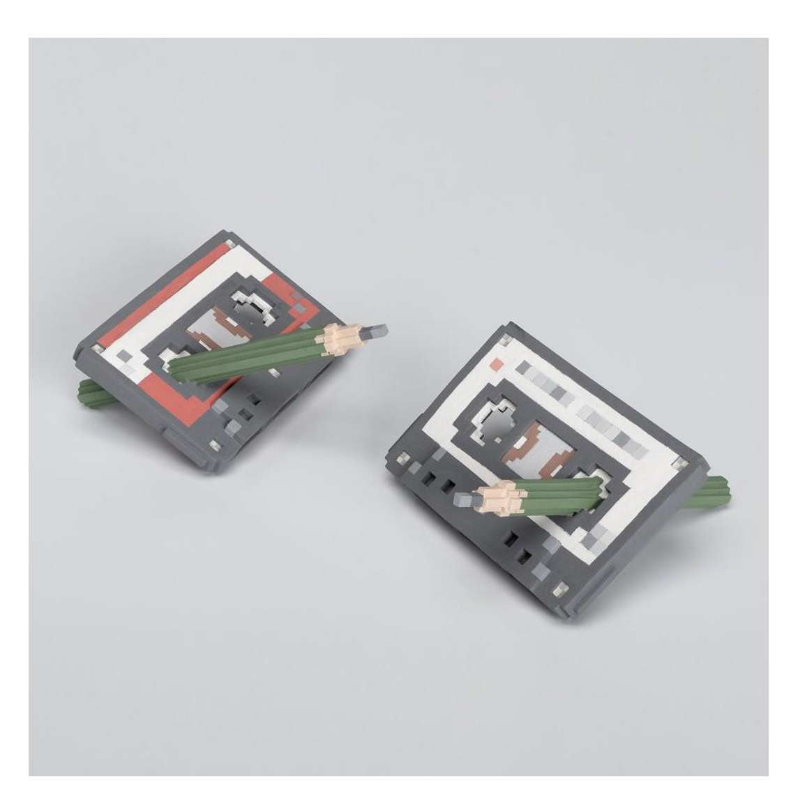
4. Low pixel CG -Intertwined 2019 ceramic w14.0 d11.5 h6.0 cm each