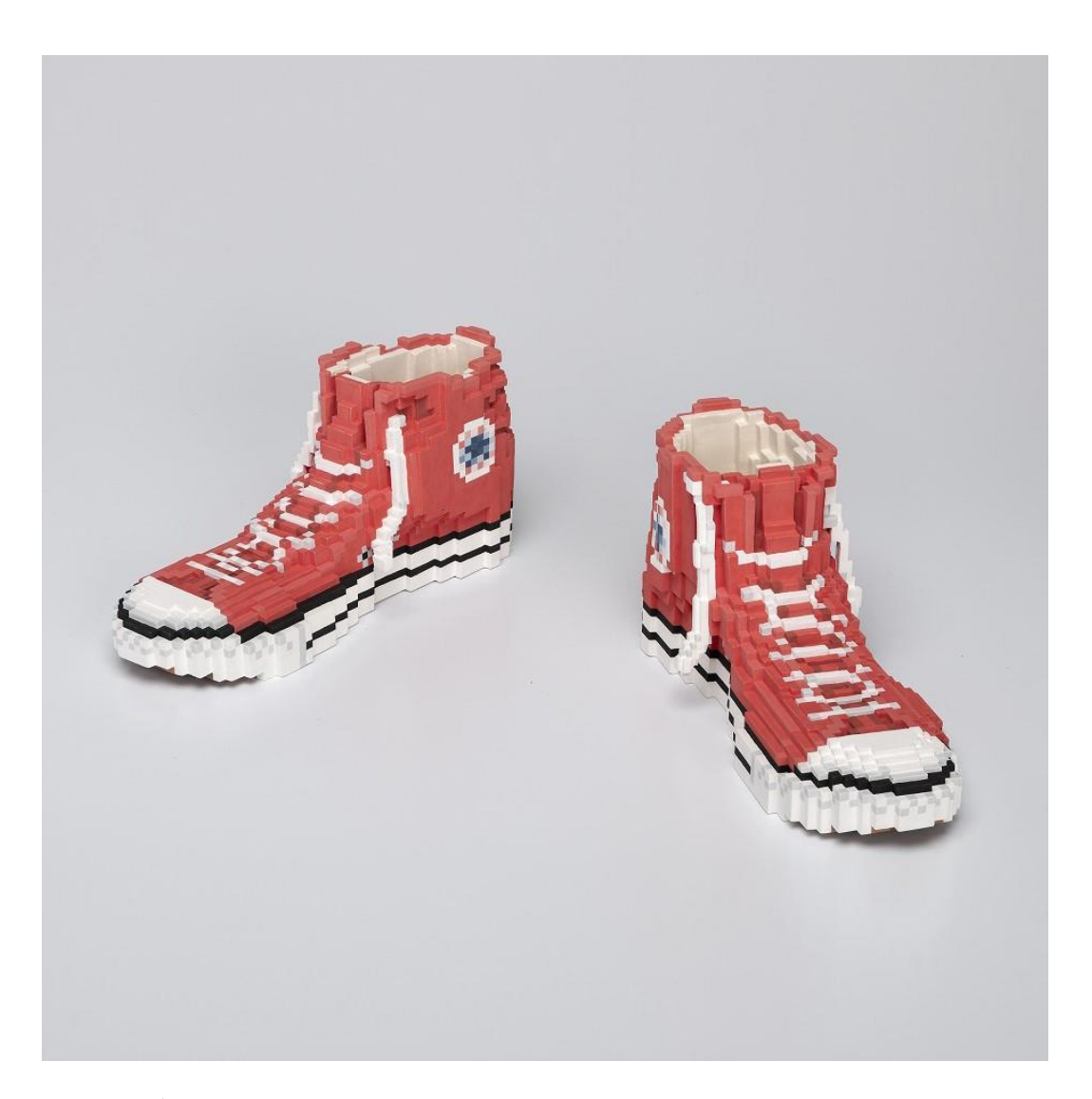
1. Low pixel CG -All Star-2019 ceramic w29.0 d12.0 h13.5 cm