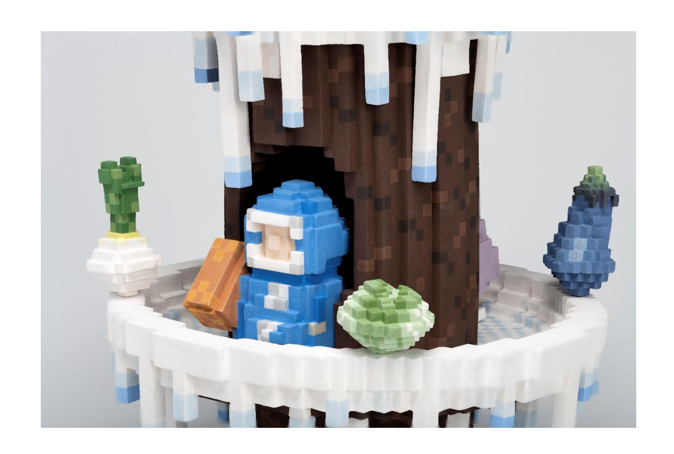
Masuda Toshiya Nostalgic Future